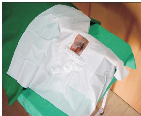
Eye Drape Poly