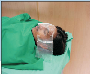
Eye Drape NW Blue Large D704